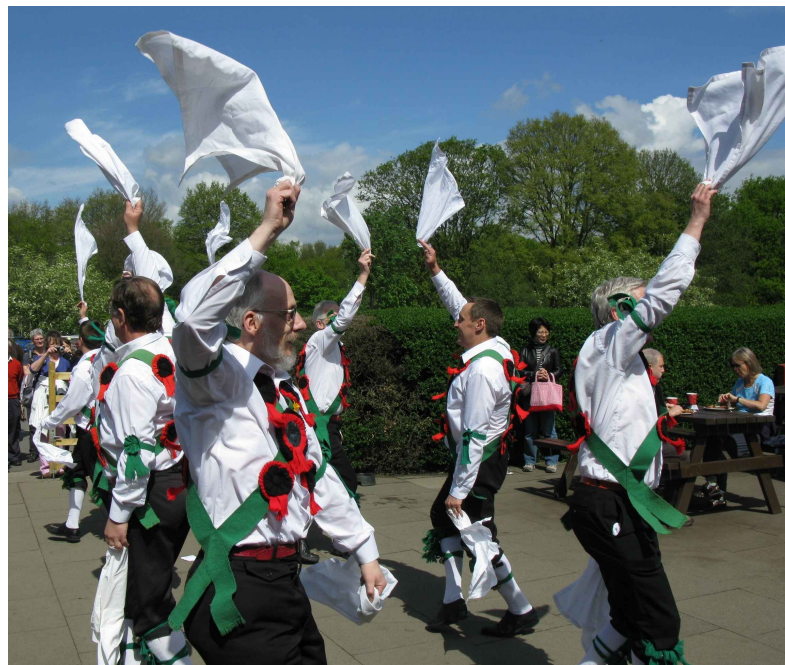
Hankies fly at Windmill Tearooms, Wimbledon Common, May Day 2010